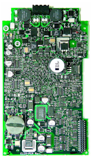
Loop Control Module